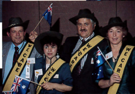
New Faces from Distant Places ...