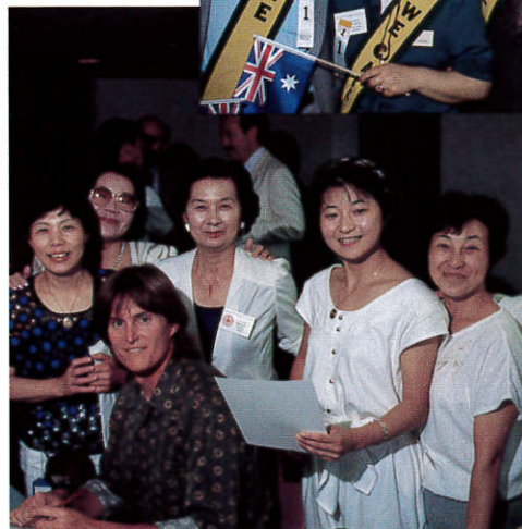
▶ Neo-Life Japan Distributors visit with Bruce Jenner.